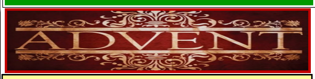
Watch, therefore; you do not know when the lord of the house is coming, whether in the evening, or at midnight, or at cockcrow, or in the morning. May he not come suddenly and find you sleeping.